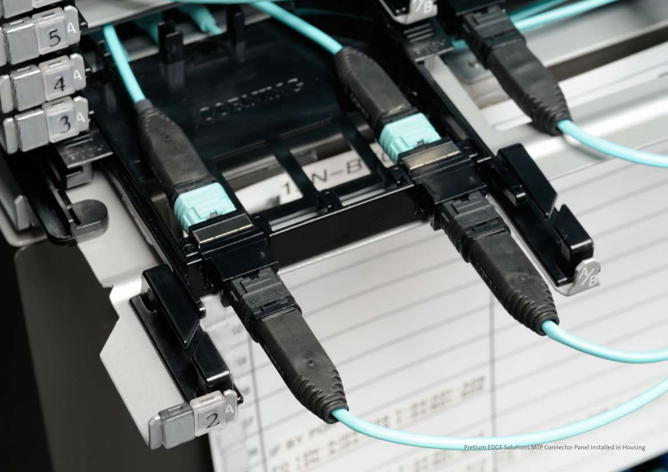
Pretium EDGE Solutions MTP Connector Panel Installed in Housing