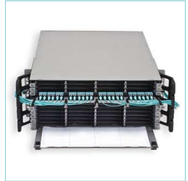
Pretium EDGE Housing