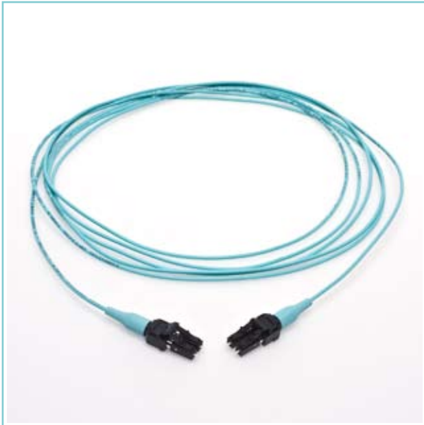
Pretium EDGE Jumper