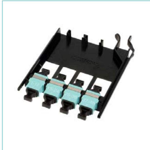
Pretium EDGE MTP Panel