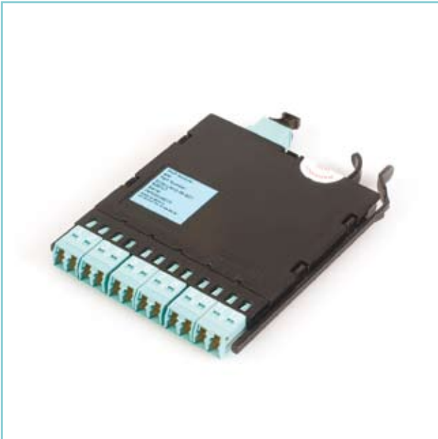
Pretium EDGE Packaging Module