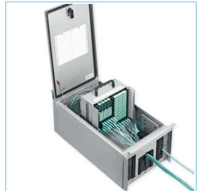
Pretium EDGE Compact Zone Box