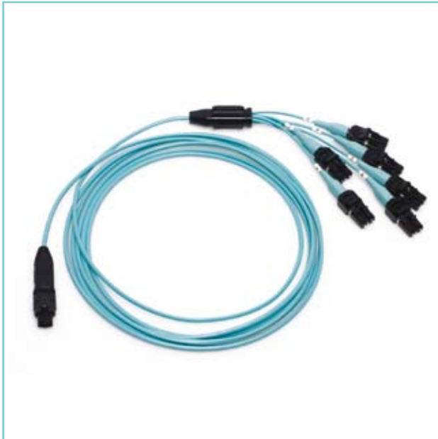
Pretium EDGE Harness