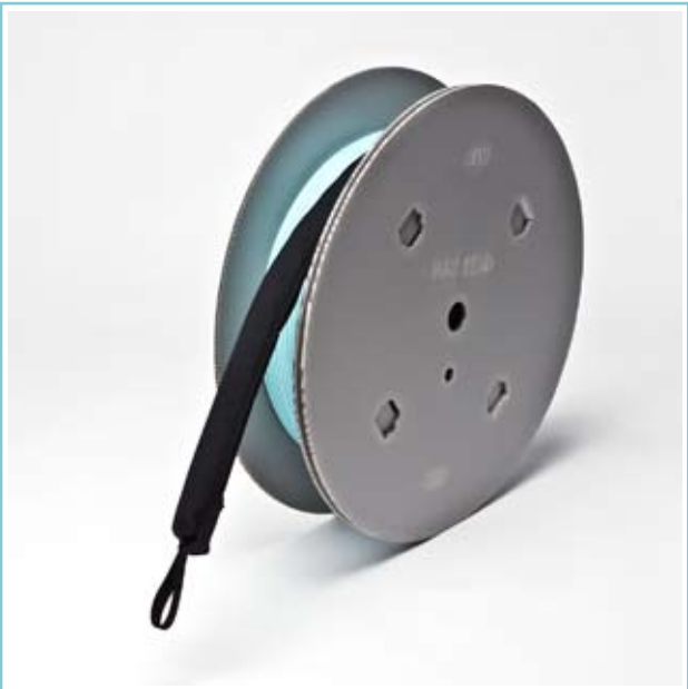
Pretium EDGE Trunk Cable, Reel Packaging